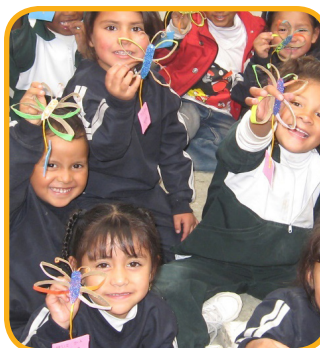
Kindergarten students show off the crafts they have made.

My life changed noticeably. I now had gained stability in every sense and I was happy with my daughter. She began to attend church, and eventually so did I. The relationships here make me realize that this is my place, where I can find peace, refuge, and support.